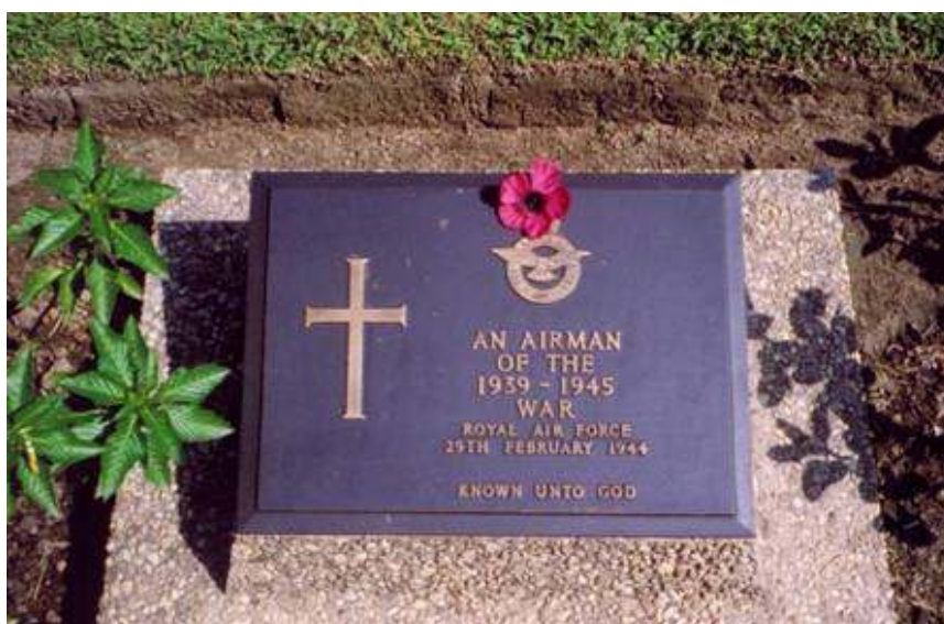
D.F.M. from the King 1941

A photo of one of the seven graves, each bearing the identical inscription: