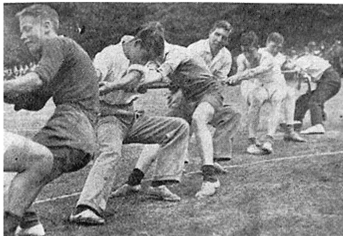
In the Boys' Tug o' War, Talbot beat Holgate

The final placing of the "Houses" was close, Talbot House winning the challenge cup with 68 points, Price House being second with 65 points, Holgate third with 60 and Guest fourth with 24 points.