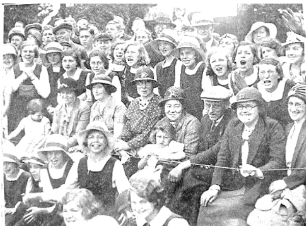
Parents, friends and pupils watch the 1934 sports