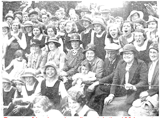
Parents, friends and pupils watch the 1934 sports